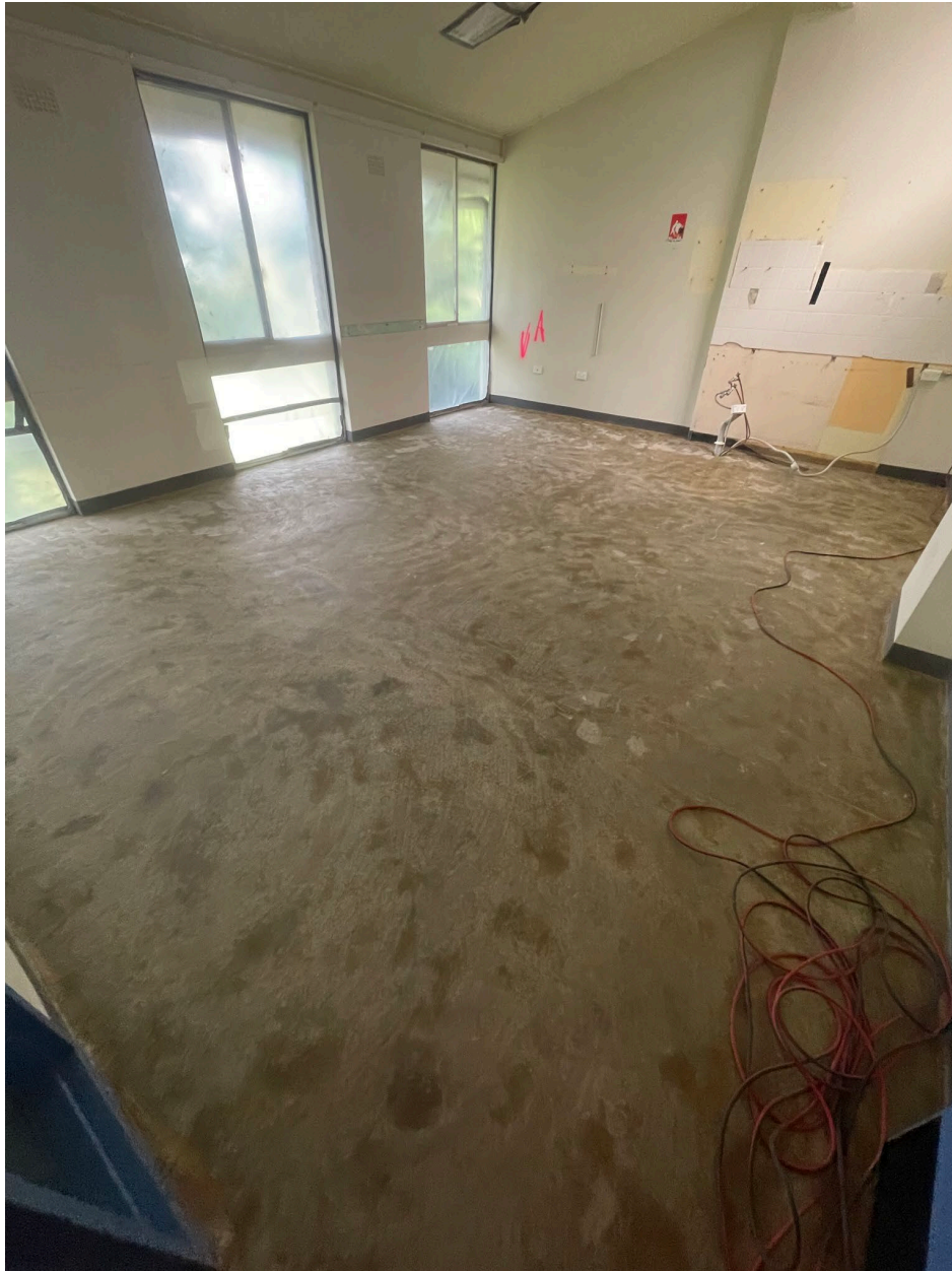
Typical concrete floor in room in the northern part of the CTC Building at St John of God Richmond Hospital, 177 Grose Vale Road, North Richmond NSW at completion of visual clearance inspection on 19 October 2022