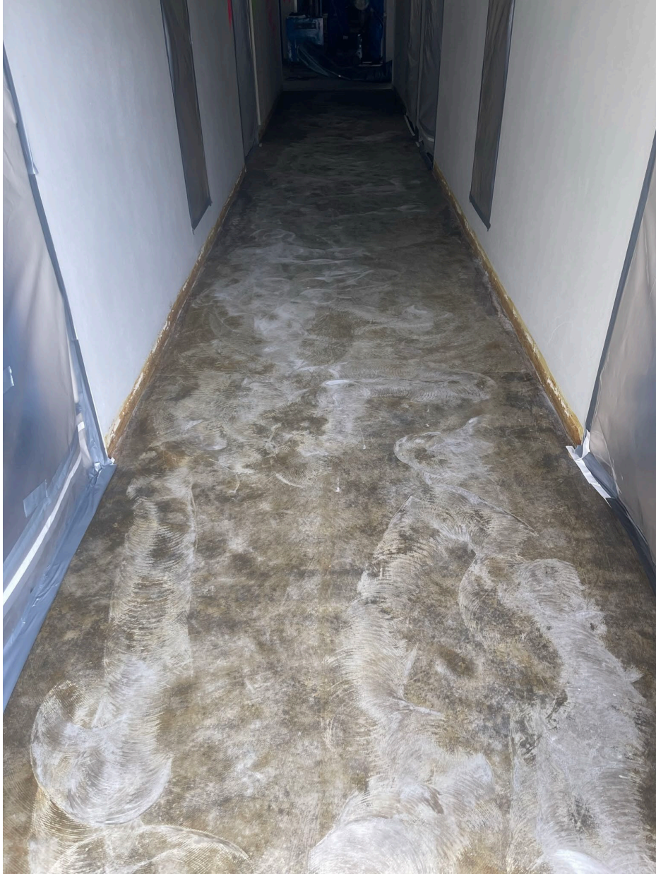
Concrete floor in corridor in the northern part of the CTC Building at St John of God Richmond Hospital, 177 Grose Vale Road, North Richmond NSW at completion of visual clearance inspection on 19 October 2022