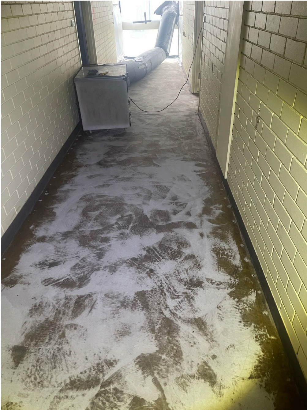
Concrete floor in corridor in the eastern part of the CTC Building at St John of God Richmond Hospital, 177 Grose Vale Road, North Richmond NSW at completion of visual clearance inspection on 11 October 2022