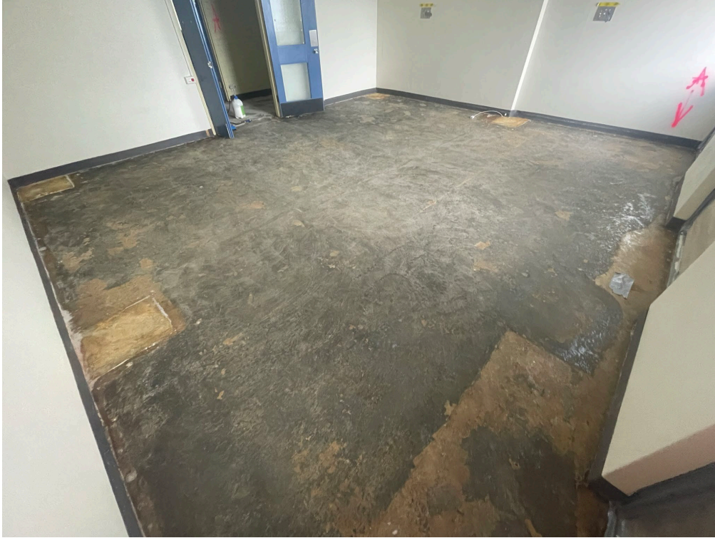
Concrete floor in typical room in the eastern part of the CTC Building at St John of God Richmond Hospital, 177 Grose Vale Road, North Richmond NSW at completion of visual clearance inspection on 11 October 2022