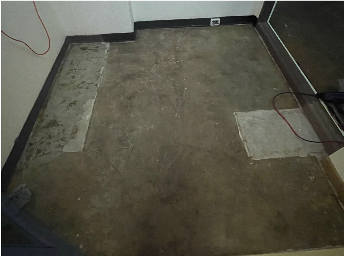
Typical concrete floor in a room in the southern part of the CTC Building at St John of God Richmond Hospital, 177 Grose Vale Road, North Richmond NSW at completion of visual clearance inspection on 4 October 2022