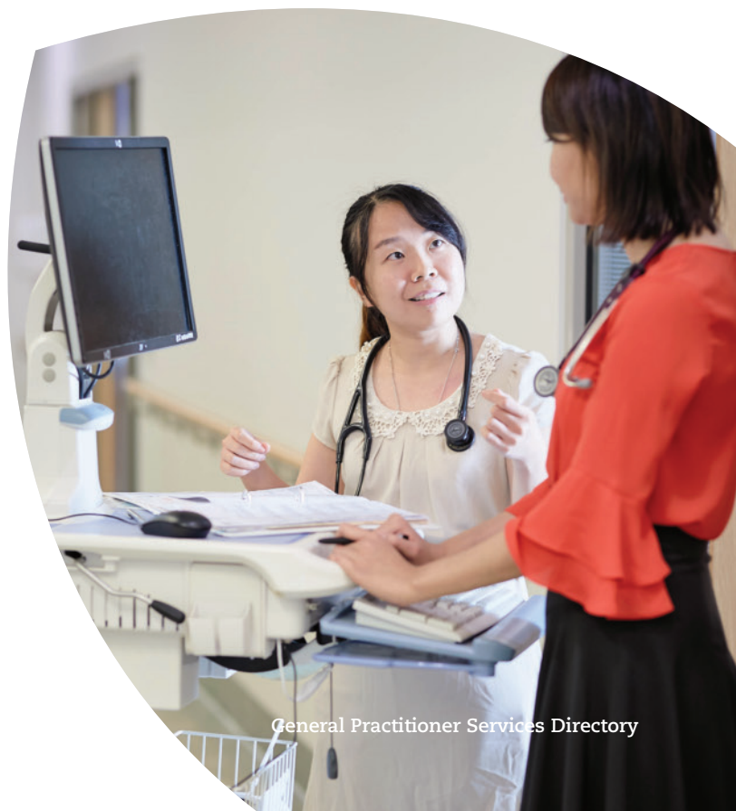
General Practitioner Services Directory

Please refer to the Private Specialist Directory for a full listing of our private hospital specialists or for the most up to date information go to sjog.org.au/find-a-doctor .